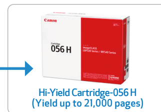
Hi-Yield Cartridge-056 H (Yield up to 21,000 pages)

Use of Canon GENUINE toner cartridges helps provide longer equipment life, high yields, reliable performance, high-quality output, and minimal jamming or issues.