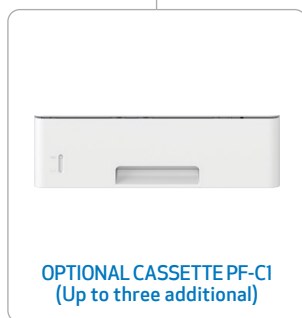
OPTIONAL CASSETTE PF-C1 (Up to three additional)